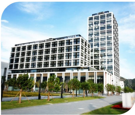
Howard Johnson Parkland Hotel

It is a five-star hotel near Xinghai Square and Coast. It is about 8km from Dalian Airport to the hotel, and it takes US$ 6 by taxi or US$ 0.5 by subway.